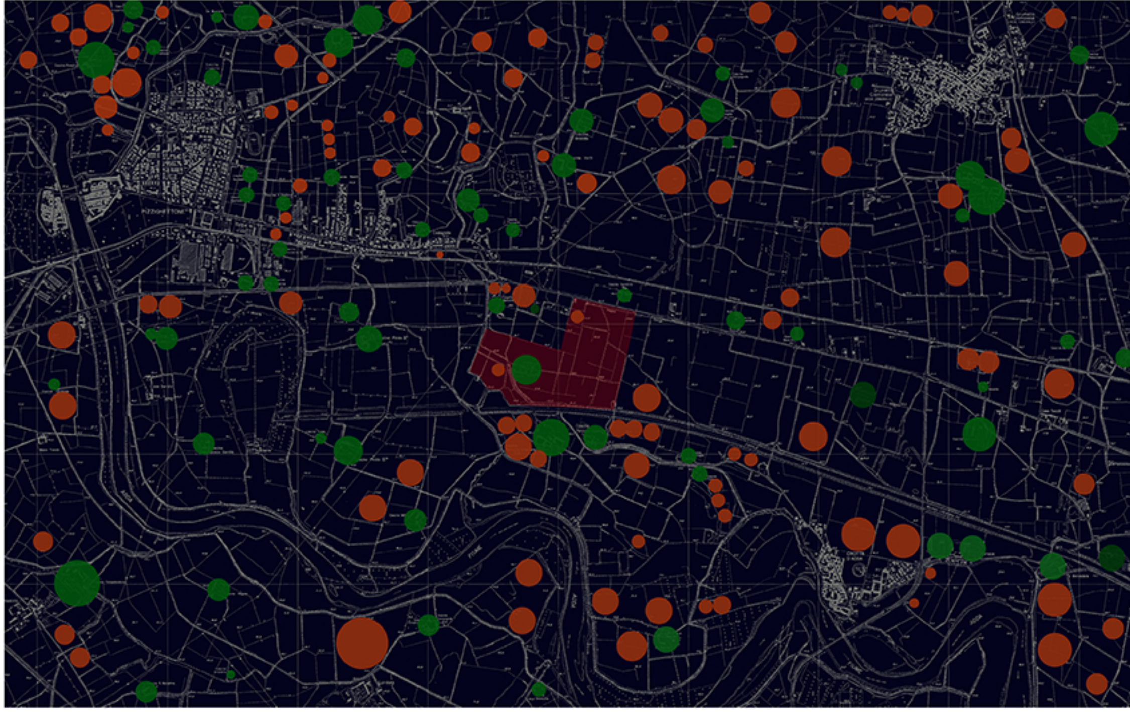
Input of material to produce biogas - Farms and Crops

● Harvest residue producers ● Farms - animal waste producers