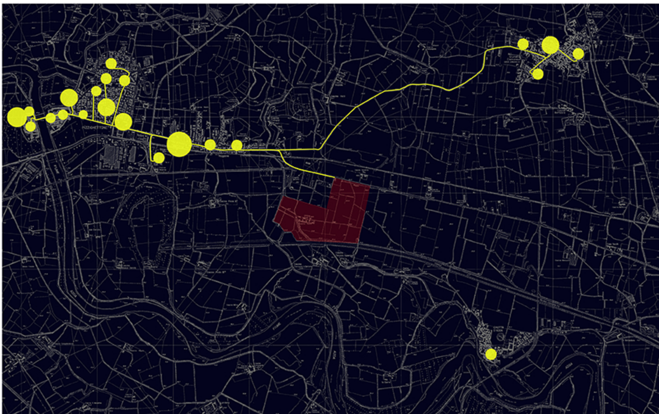
Output of vegetables from the greenhouse

● Supermarkets and markets — Infrastructure